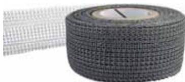
Comparable to 3M 24