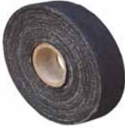
Comparable to 3M 1755