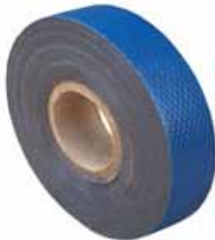
Comparable to 3M 2155