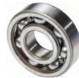
BALL BEARINGS NOW STANDARD