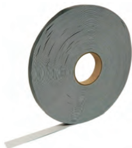
ADHESIVE ON BOTH SIDES